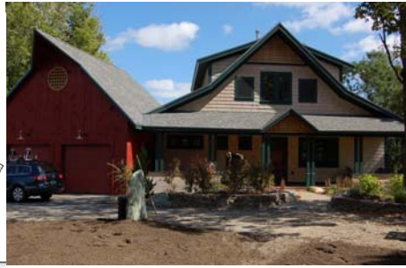
2Morrow Studios Design/Build Farmhouse reBuild in South Burlington

Is it possible to have an affordable custom built home with energy-efficient design using the latest green and sustainable technologies? Yes, and 2Morrow Studios has been making this possible for the past several years.